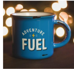
Adventure Fuel Camping Mug $20.00