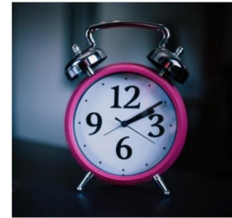
Alarm Clock $15.00