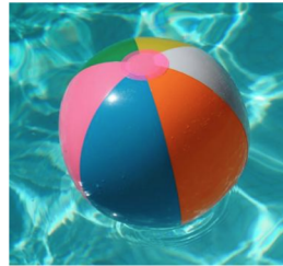
36" Classic Beach Ball $12.99